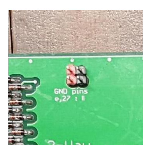
Figure 5. JAMMA Pins "27" and "e" Selection

Refer to the Figure 3 for JAMMA pinouts. The initial JAMMA standard indicated that these pins were signal grounds. However, many gameboards have repurposed these pins for button inputs. To use pins "27" and "e" as button inputs, leave the pins vacant, as shown in Figure 5 below. To modify these pins to be grounded, apply jumpers (also commonly referred to as shunts). To jumper, the two red pins should be connected together, and the two black pins as well. This option should be configured for each gameboard uniquely.