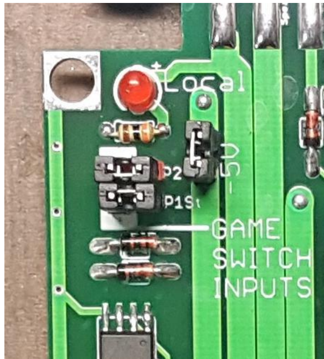
Figure 4. Button Inputs for Game Selection

If both jumpers are installed as shown, the mainboard will switch games when buttons Player 1-Start and Player 2-Start are pressed for 1.5 seconds. To use alternate button inputs, disconnect the 2 jumpers, and connect two button inputs of your choice to the two terminals on the left side when positioned as shown in Figure 4. If only one input button is desired, connect it to BOTH pins. The Switcher will change games when both inputs are grounded for 1.5 seconds. If both buttons are held down, it will continue to cycle between games in 1.5 second increments.